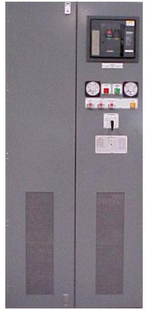
Model 1600 SCR Control Unit